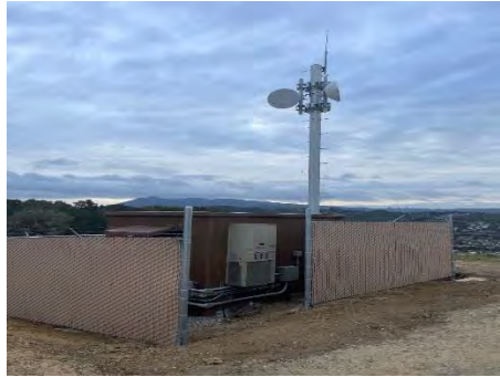
Skyview Terrace microwave site.