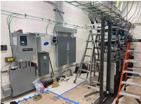
OTA Site installation in progress.

We anticipate moving all our radio users to the new Next Gen System in late September/early October of this year.