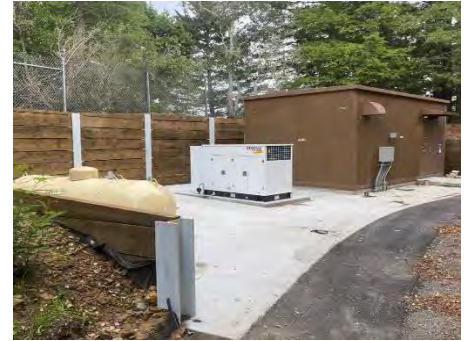
Mill Valley water tank site.