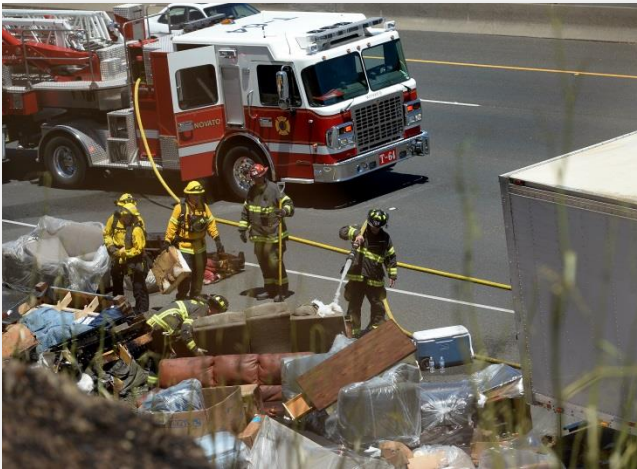
Burning furniture is removed from the truck

While firefighters battled the truck fire additional firefighters responded to Alameda del Prado to battle the grass and brush fire with the goal of preventing the fire from spreading across Alameda del Prado and impacting the apartment building above the fire.