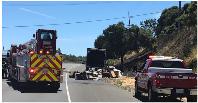
Truck fire on SB Hwy 101

Firefighters responded to a report of a truck on fire on southbound Highway 101 south of the Ignacio overpass. Upon our arrival we found a truck well involved in fire and the fire had spread to the nearby hillside igniting grass and brush.