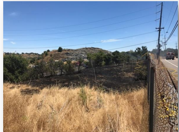
The grass fire burned a small amount of grass and brush

Traffic on Alameda del Prado was shut down to permit firefighters a safe area to operate in.