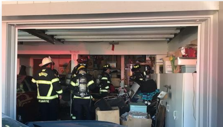
Garage fire on Yarrow Lane

The source of the small fire was a problem with an air conditioning unit. There was no damage to the structure.