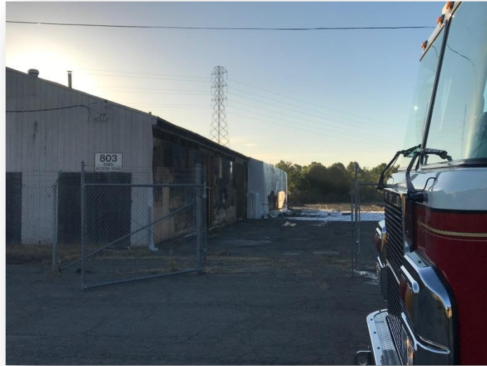
Building fire on State Access Drive

Firefighters quickly extinguished the fire before it could do significant damage to the building.