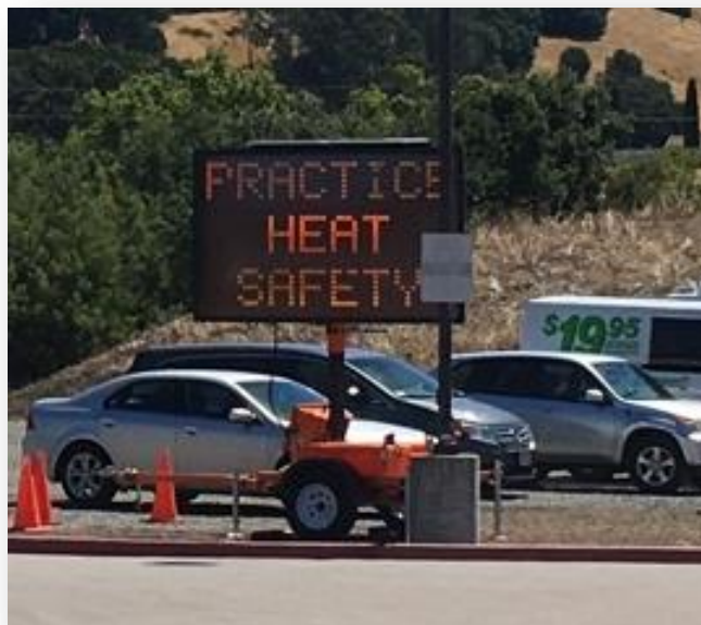
Important safety message in the Trader Joe's parking lot

We place these sign boards in locations in Novato with current important safety tips for you. Our mission is to keep you safe.